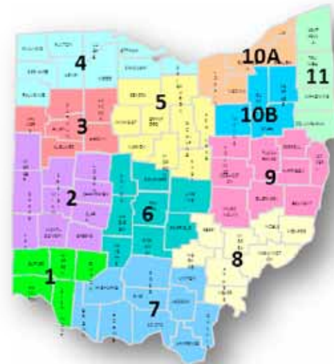
Map A. Area Agencies on Aging in Ohio

Following established ODA guidelines, the Area Agency on Aging 10B, Inc. [“Agency”] became the State authorized, but locally governed, private non-profit corporation. The PSA 10B encompasses all of Portage, Stark, Summit and Wayne Counties. [See Map A. Area Agencies on Aging in Ohio and Map B. PSA 10B Region for detail.]